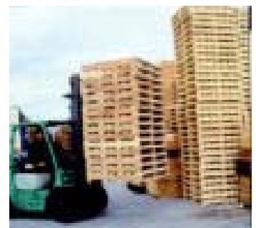
Better visibility of customer needs through forecasting & planning.